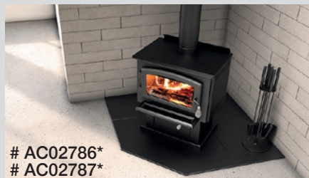
# AC02786* # AC02787*