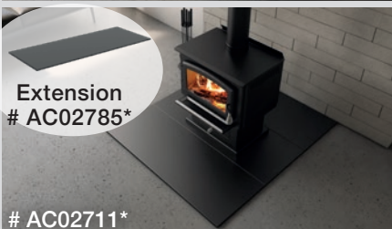
Extension # AC02785*