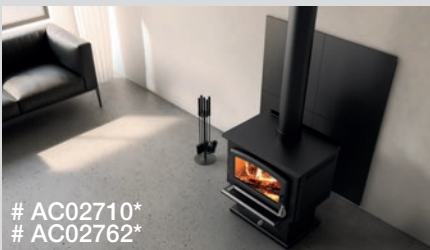
# AC02710* # AC02762*